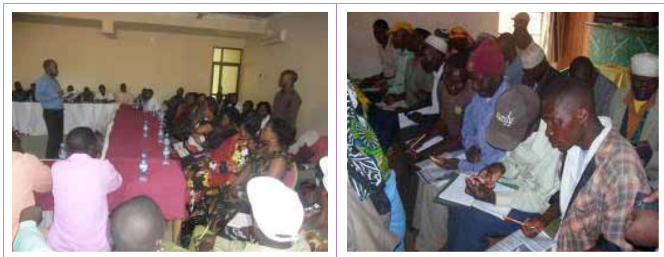
Sensitisation meetings on MAMIS.

MVIWATA brokered meetings between farmers and traders to discuss how they could exchange information on stocks and prices as well as understanding all the necessary trading requirements via MAMIS. These meetings were held on 27 th -31 st August, 2013 in Kyela and Ludewa and on 25 th -31 st September, 2013 in Kongwa, Mvomero, Njombe and Mbarali. 180 farmers (107 women and 73 men) and 60 traders (25 women and 35 men) attended these meetings.