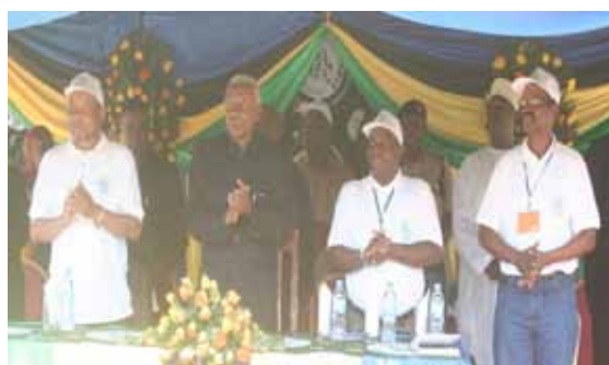
Vice President of United Republic of Tanzania, Dr Mohamed Gharib Bilal receiving the procession of MVIWATA members