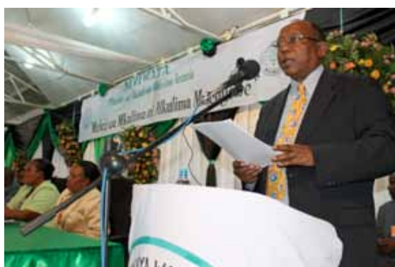
Former Prime Minister Hon Frederik Sumaye Opening the AGM of MVIWATA.