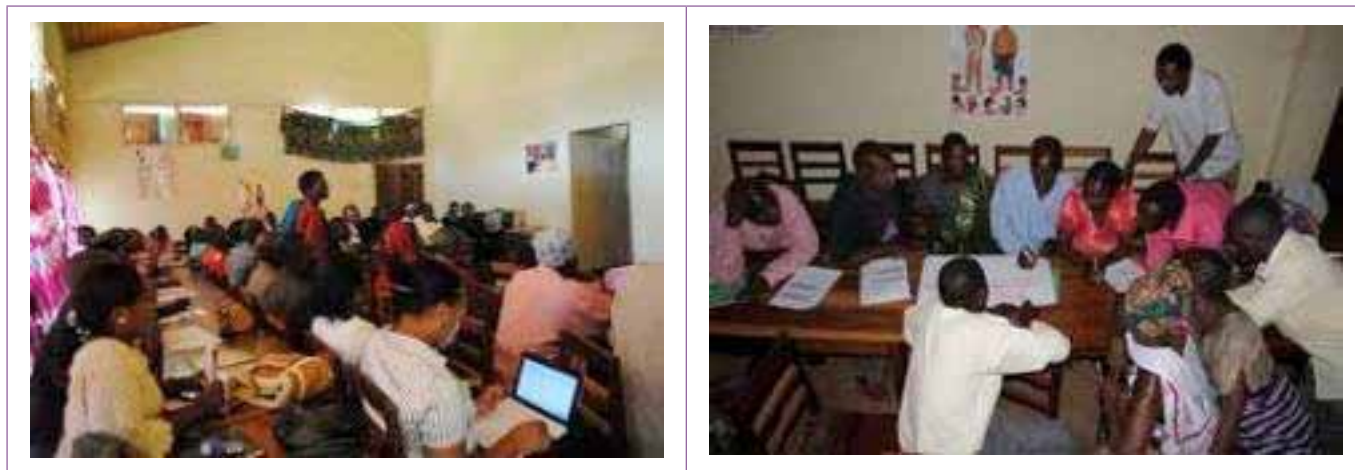
Photographs; Training sessions and group discussion in progress

The training aimed at building capacities of farmers on farming as business and on entrepreneurship development.