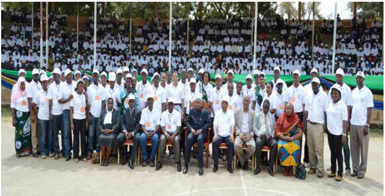
MVIWATA Staff in a group photo with the Vice President of United Republic of Tanzania, Hon. Dr Mohamed Gharib Bilal during the 20 th Anniversary Celebration of MVIWATA,

2013 Annual Report highlights some interventions and achievements for 2013 with a little perspective of 20 years life of MVIWATA. The report will give you an overview of diverse activities that MVIWATA was engaged in, achievements, partnerships and where we go from here.