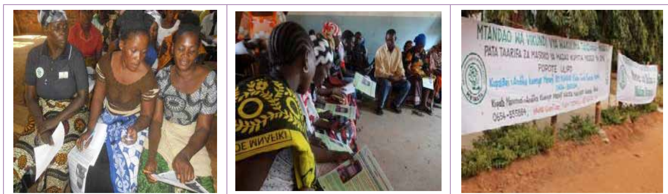
Meetings with farmers to present MAMIS. Right a banner publishing MAMIS.

Developing promotional materials and sensitization on MAMIS: 3000 posters and were produced and disseminated during sensitisation. Sensitisation meetings on the usage of market information were conducted on 19 th -23 rd August, 2013 in Kyela, 28-31 st August, 2013 in Ludewa, 23 rd September -05 th October, 2013 in Kongwa, Kiteto, Mvomero, Njombe and Mbarali where by a total of 937 farmers (516 women 421 men) were informed of MAMIS.