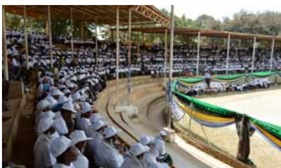
Members seated, during the anniversary at Jamhuri Stadium in Morogoro