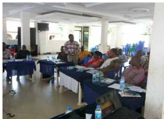
MVIWATA and MJUMITA Board members during the training at Kilosa

As reported earlier in this report, during agricultural show of 2013, 30 farmers (15 women and 15 men) from Lunenzi, Kisongwe and Ibingu villages in Kilosa district visited climate change exhibition that was part of MVIWATA activities at Morogoro agricultural show grounds.