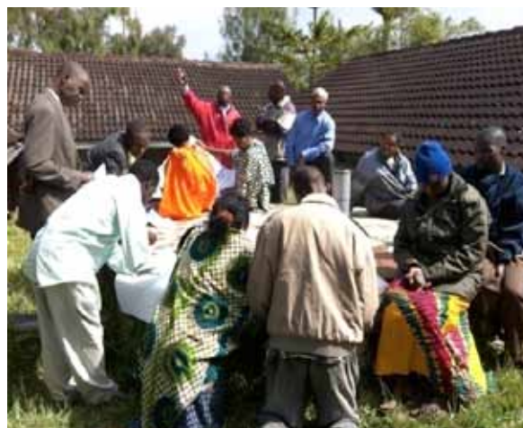
Promoters in groups' discussion during their training at Nyandira Training Centre.