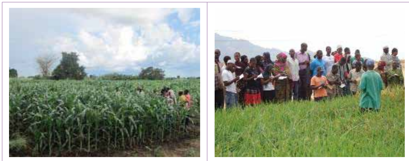
Farmers visiting a maize demo plot, left and right paddy plot.

To apply what has been learnt during exchange visits; 312 farmers (139 women and 173 men) who participated in a visit established 10 demo plots in Mvomero.