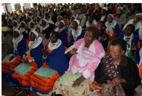
A section of AGM of MVIWATA