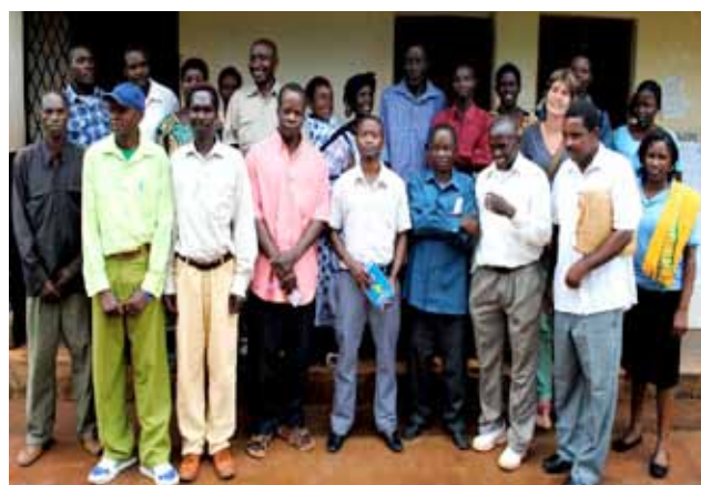
Left is MVIWATA and MJUMITA staffs visiting a group demo plot of beans at Kisongwe village in Kilosa and right is MVIWATA Ruvuma participants in an exchange visit at Msindo ward.