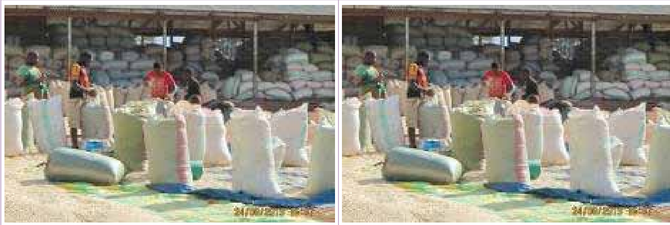
Cleaning and bagging activities at Mkata market, ready for sale.

Matai market: 2511 tons of maize worth approximately T Shs 1.3 billion was traded from July to September, 2013. Tshs 65 million were collected as crop levies, 60% of it was paid to the district council and the remaining 40% remained for supporting operations at the market.