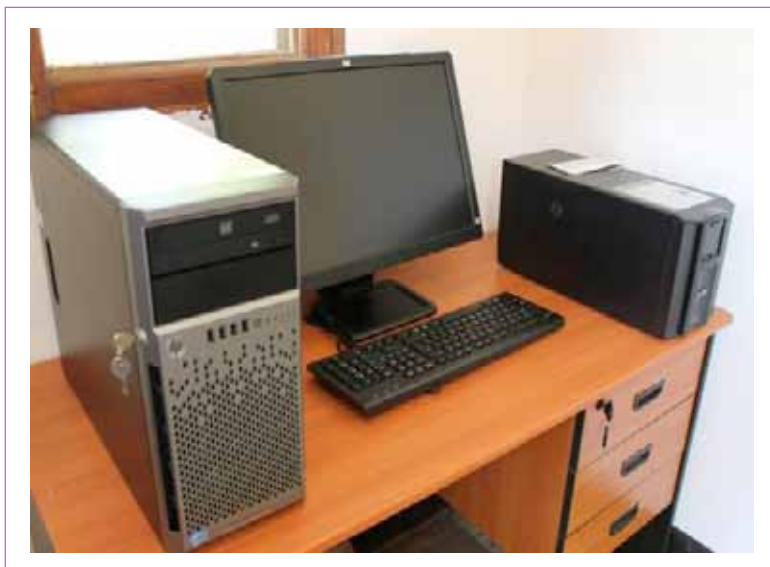
The new MAMIS hardware with a server

New equipment was procured to increase capacity of MAMIS. To replace the old devices, a server with 3.1GHz/4-core processor, 4GB RAM and 2000 GB hard drive storage were procured. MAMIS is still under development to cater for the increasing demand and currently we are establishing the link with mobile partner.