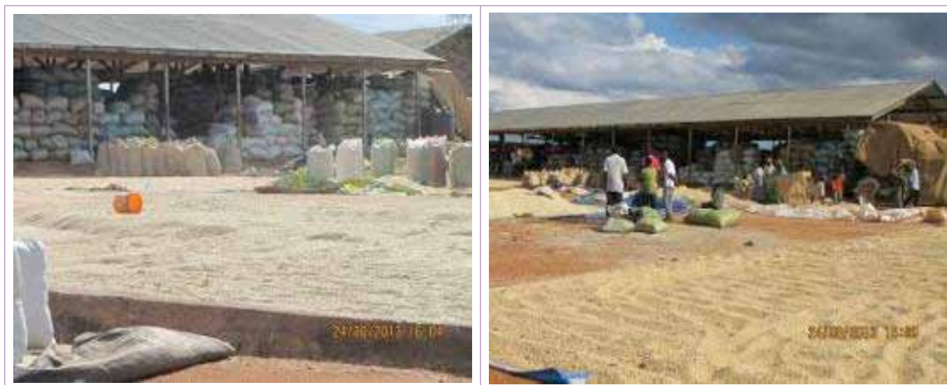
Market scene at Mkata market

In Mkata market: 1860 tons of maize worth nearly Tsh 1.0 billion were sold at the market at the price ranging from Tshs 500 to 530/kg while outside the markets the price was Tshs 440/kg. An average of 40 people per day from the local community were employed at the market for cleaning the maize, bagging, loading and off-loading the maize from the trucks earning an average income of Tshs 1,500 per day.