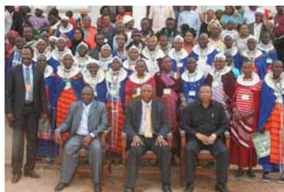
Some of AGM delegates in a group photo