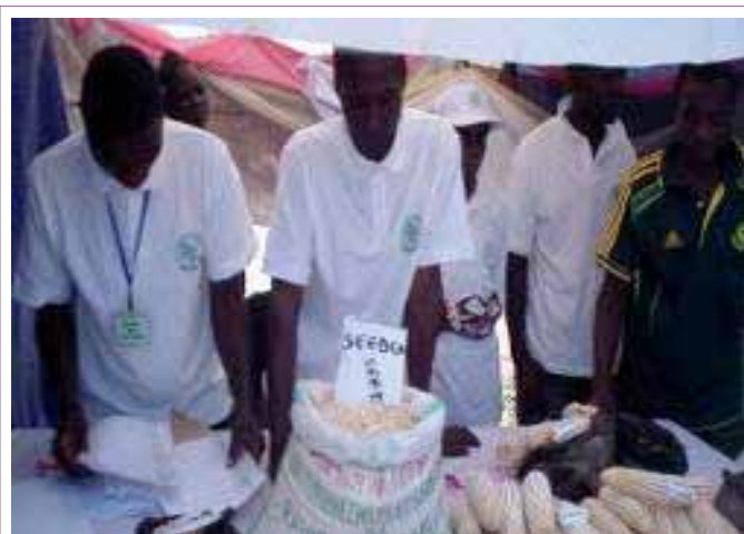
Farmers at exhibition in Mvomero district.