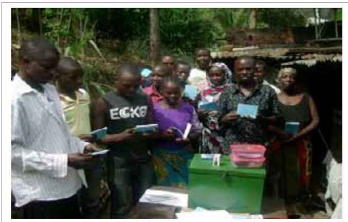
VICOPA members at Bamba village, Morogoro rural contributing their weekly shares