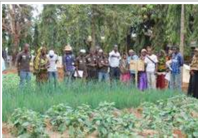
MVIWATA members held exhibitions in villages

On their own initiative and their own financial contributions MVIWATA members in Mvomero organised their own agricultural show on 12 th of August, 2013 in which about 1500 farmers from 13 villages of Mvomero district attended. The organisers were able to register 476 farmers (252 women and 224 men) in the attendance sheets and became overwhelmed.