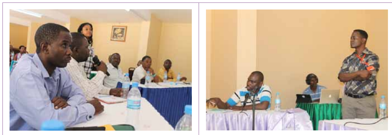
Haba na Haba radio programme recording in progress at Morogoro Hotel.

On 17 th and 18 th of December, 2013, 7 MVIWATA members participated in a programme called Haba na Haba organised by BBC Media action held in Morogoro to talk about ongoing famers and pastoralists land conflicts.