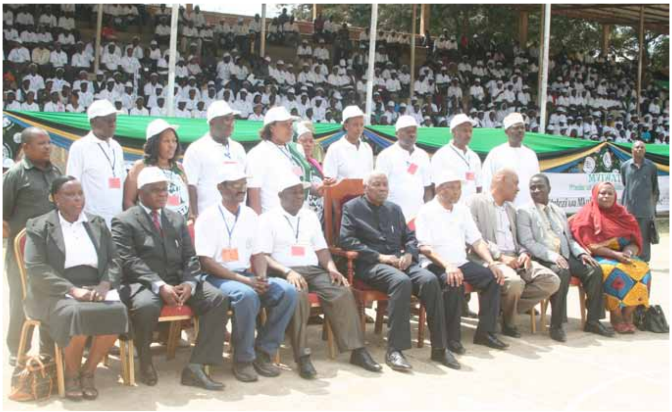
Members of Board of Directors of MVIWATA in a group photo with the Vice President of United Republic of Tanzania, Hon. Dr Mohamed Gharib Bilal during the 20 th Anniversary Celebration of MVIWATA

I would like to thank our partners for supporting activities in 2013 but also for walking with us for the last 20 years of the existence of MVIWATA.