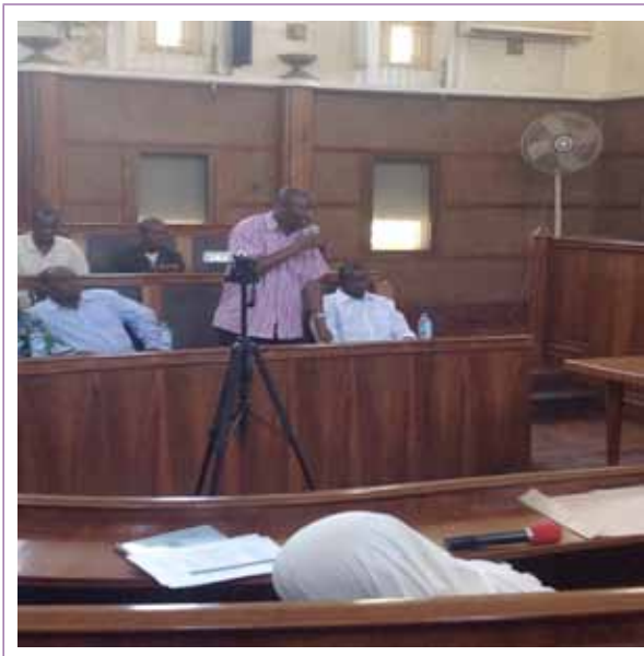
Policy Advocacy Officer of MVIWATA making a presentation to the Constitution Review Commission at Karimjee Hall –Dar es Salaam

b) Facilitate consultation forums, public debates/dialogues and media conferences/events with farmers, legislators, media and government officials for lobbying and advocacy on issues affecting SHFs