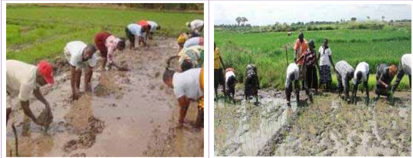
Farmers during field practical training at Mkindo Agricultural College

To enable learning by practice MVIWATA facilitated establishment of 147 demonstration plots; 66 maize demo plots in Njombe, Mbeya, Kilimanjaro and Morogoro; 40 paddy demo plots in Shinyanga, Morogoro and Mbeya; 11 tomato demo plots in Morogoro; 27 maize demo plots in Mto wa Mbu, Arusha and 3 sunflower demo plots in three wards of Engutoto, Selela and Engaruka.