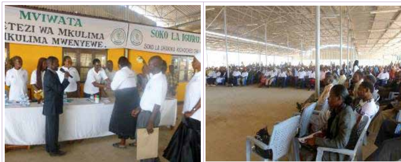
Igurusi market day to promote the market

In Igurusi, the market stakeholders organised an open market day on 29 th of May 2013 to promote the use of Igurusi market. MVIWATA participated alongside other close to 1200 stakeholders with a total of 1200 participants. Farmers, traders, representatives from service provider institutions like NMB and TCCIA, farmers organizations, district council and media participated in the event.