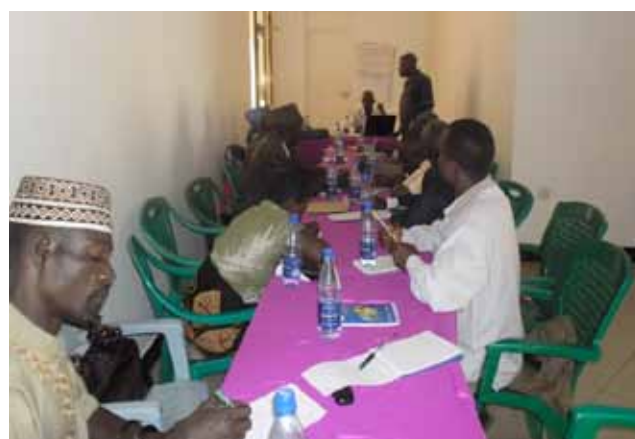
Participants in PETS training, Kilosa (left) and Muleba (right)

A number of exchange visits in which 59 (35 men and 24 women) farmers participated. The exchange visits were on various learning areas such as land demarcation exercise in Ruvuma Region, climate smart agriculture in Kilosa District and sharing experience on group management.