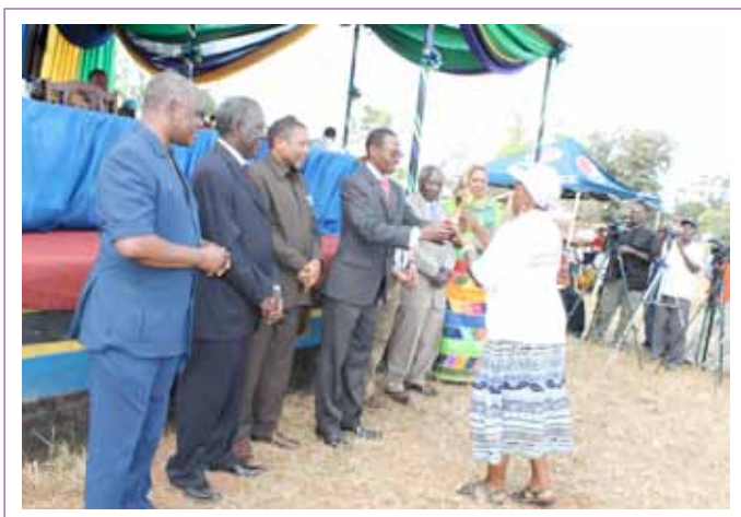
Mviwata representative receiving an award for the first prize in NGOs group