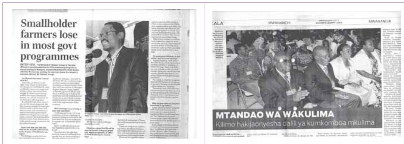
Some cuttings of MVIWATA stories covered by different newspapers

Television channels and radio stations including BBC and Radio France widely covered activities and events of MVIWATA on topics such as land conflicts among farmers and pastoralists, land right issues, small scale farmers' engagement in new constitution and agricultural policy issues. The events that were covered include the following: