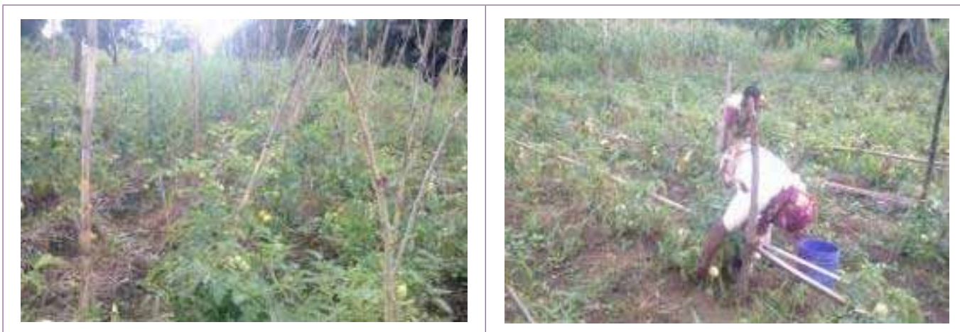
Tomato demo plot in Kiroka village, Morogoro

To enable learning by practice MVIWATA facilitated establishment of 147 demonstration plots; 66 maize demo plots in Njombe, Mbeya, Kilimanjaro and Morogoro; 40 paddy demo plots in Shinyanga, Morogoro and Mbeya; 11 tomato demo plots in Morogoro; 27 maize demo plots in Mto wa Mbu, Arusha and 3 sunflower demo plots in three wards of Engutoto, Selela and Engaruka.