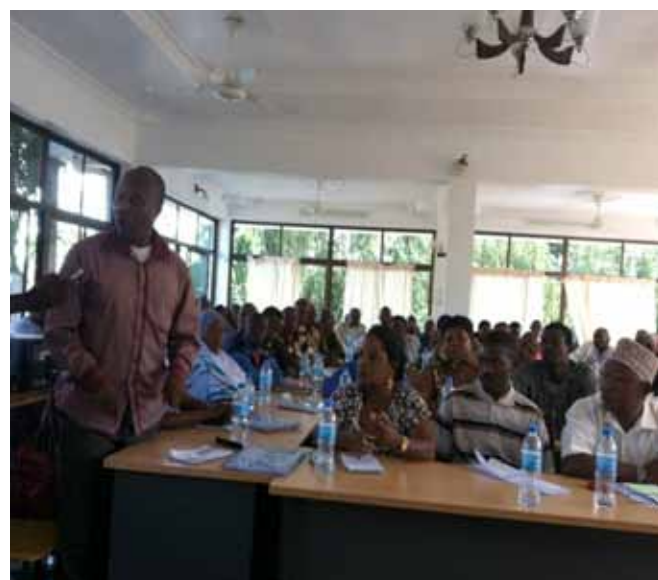
Right, MVIWATA's council meeting members during budget discussion and left is one of coverage in local newspapers concerning the discussion.