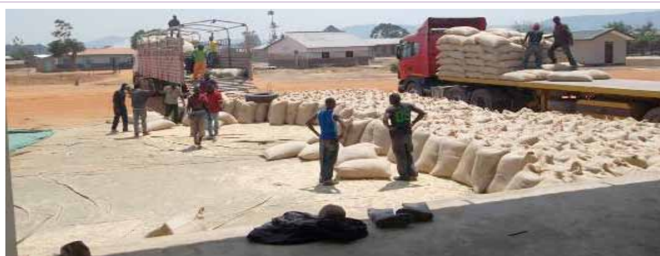
Market activities at Matai market

Matai market: 2511 tons of maize worth approximately T Shs 1.3 billion was traded from July to September, 2013. Tshs 65 million were collected as crop levies, 60% of it was paid to the district council and the remaining 40% remained for supporting operations at the market.