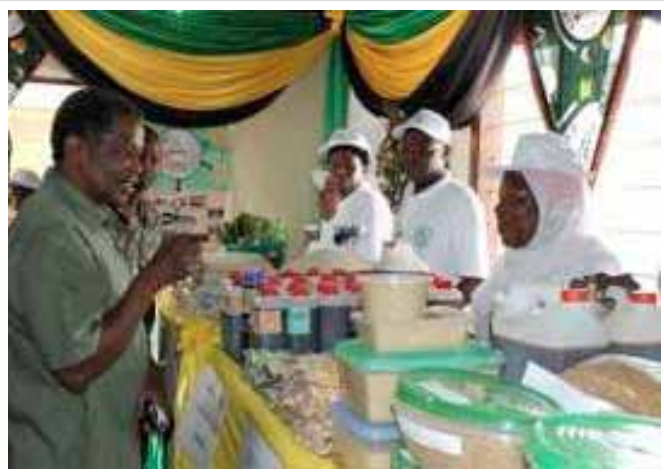
District Commissioner Ahmad Kipozi visiting MVIWATA pavilion at Morogoro grounds.