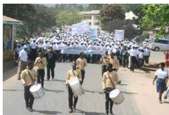
Procession of 20 years in progress